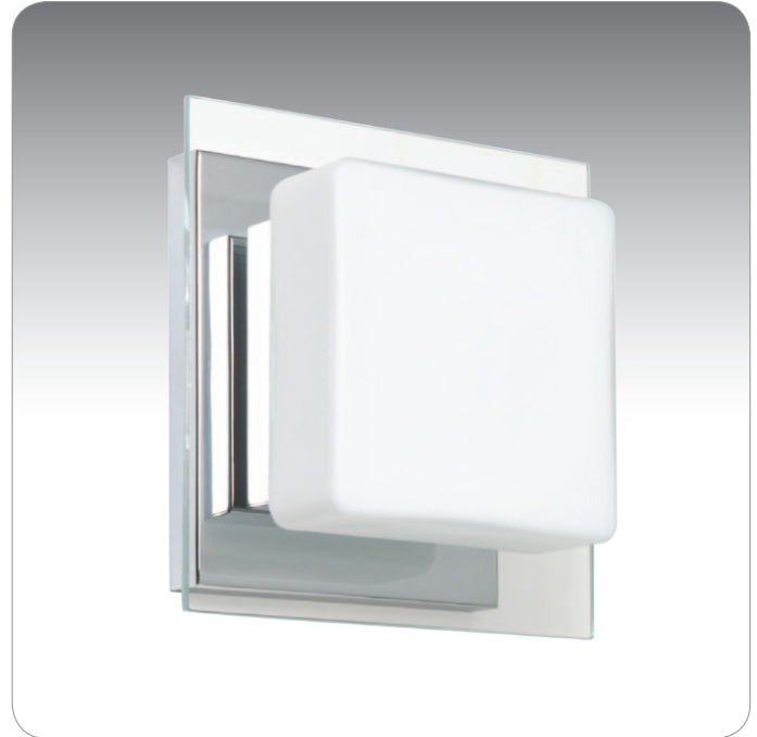
ALEX SHOWN IN OPAL/CLEAR (773539)

UL or ETL Listed. Suitable for Damp Locations (interior use only).